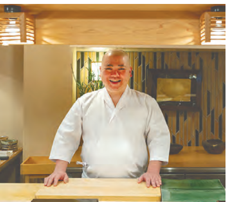
TAEKO TERAO CONTRIBUTING WRITER

Spotlighting a Niigata castle town through sushi